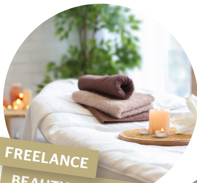
FREELANCE BEAUTY THERAPIST