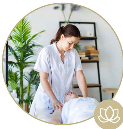
Beauty Therapy Apprentice

Hairdressing, barbering, and beauty therapy apprentices have many opportunities to progress into senior roles. The communication, business and problem-solving skills they gain during their training prepare them for a range of careers in and outside of the hair and beauty industries.